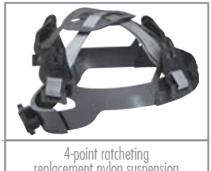
4-point ratcheting replacement nylon suspension