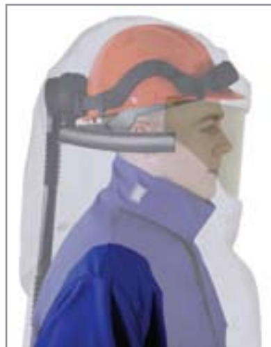
Use this unit with Salisbury Arc Flash Protective PRO-HOODs.

◀ SALISBURY'S PRO-AIR ACAIR2000 - NEW UPGRADED CIRCUIT BOARD AND BATTERY Salisbury's PRO-AIR ACAIR2000 system is designed to blow forced ambient air through a single intake hose, providing fresh oxygen to the worker and reducing the hazardous effects of shield fogging. The unit is microprocessor controlled and operates automatically by blowing air continuously for over three hours on one charge. On the back of the unit is a button that pauses the continuous flow, if needed. Use this unit with Salisbury's PRO-HOOD® and PRO-WEAR® arc flash protection clothing.