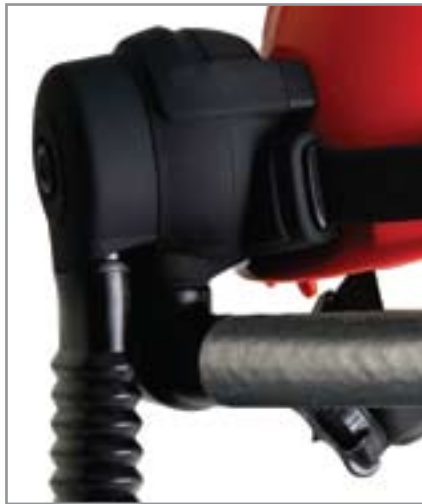
Intake hose attaches to the blower unit with a bendable joint to allow easy movement.